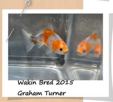
Wakin Bred 2015 Graham Turner