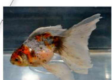
Nacreous Veiltail