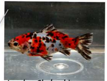
London Shubunkin Alan Ratcliffe