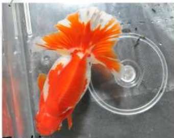
Tosakin Alan Race