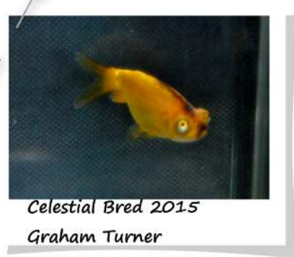
Celestial Bred 2015 Graham Turner