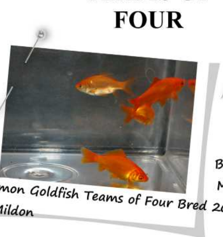
Common Goldfish Teams of Four Bred 2015 Ian Mildon