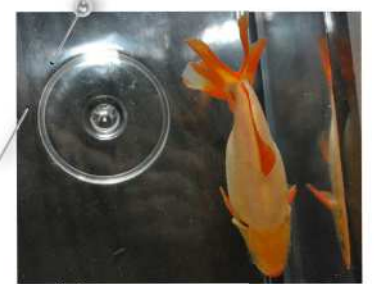
Jikin Alan Race