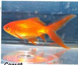
Comet Alan Ratcliffe