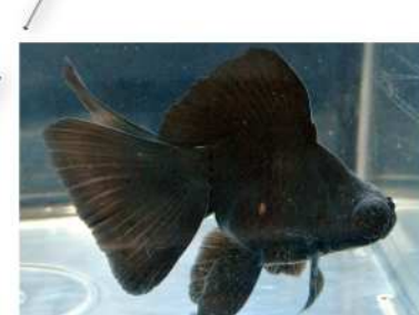
Broadtail Moor Graham Turner