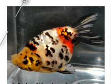
AOV with standards Sheridan Moores