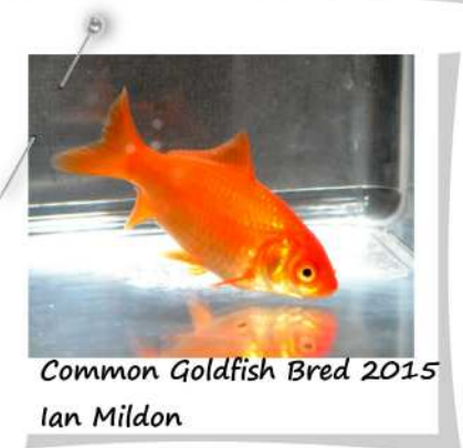
Common Goldfish Bred 2015 Ian Mildon