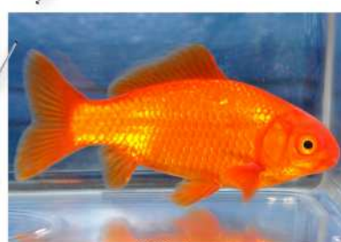
Common Goldfish