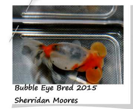
Bubble Eye Bred 2015 Sherridan Moores