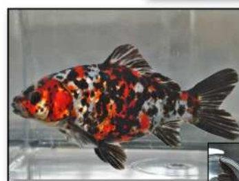
London Shubunkin over 3" Brian Parkin