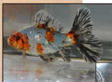
Bristol Shubunkin over 3" Brian Bates