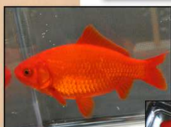
Common Goldfish Over 3" Sherridan Moores