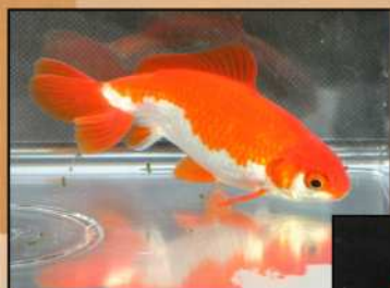
New Variety Non Standard Ian Mildon