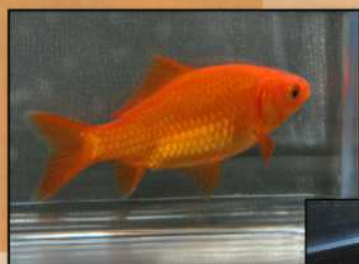
Common Goldfish Under 3" Ian Mildon