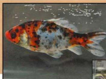
London Shubunkin under 3" Tony Waterhouse