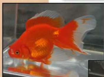
Metallic Veiltail