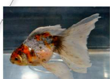
Nacreous Veiltail