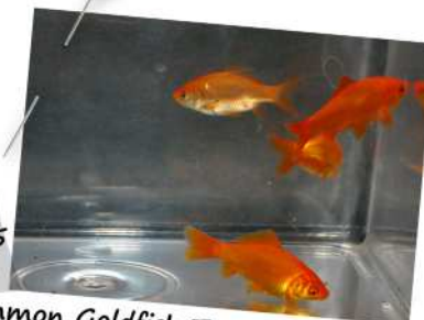
Common Goldfish Teams of Four Bred 2015 Ian Mildon