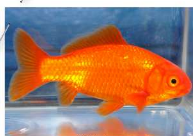
Common Goldfish