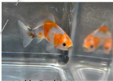
Wakin Bred 2015 Graham Turner