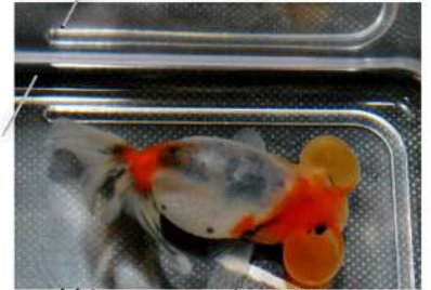
Bubble Eye Bred 2015 Sherridan Moores