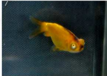
Celestial Bred 2015 Graham Turner