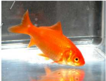
Common Goldfish Bred 2015 Ian Mildon