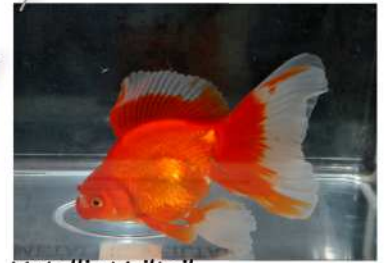
Metallic Veiltail